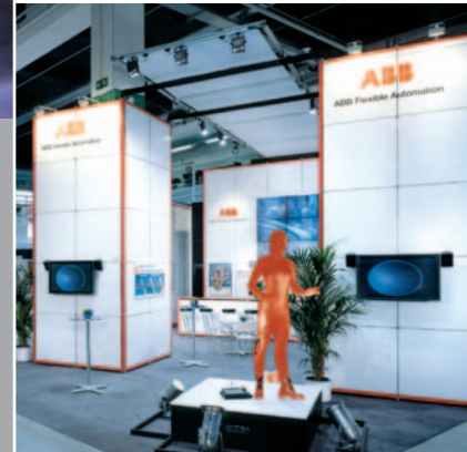
Aluminum extrusion exhibit system made with 3 mm white Dibond panels with vinyl applied.